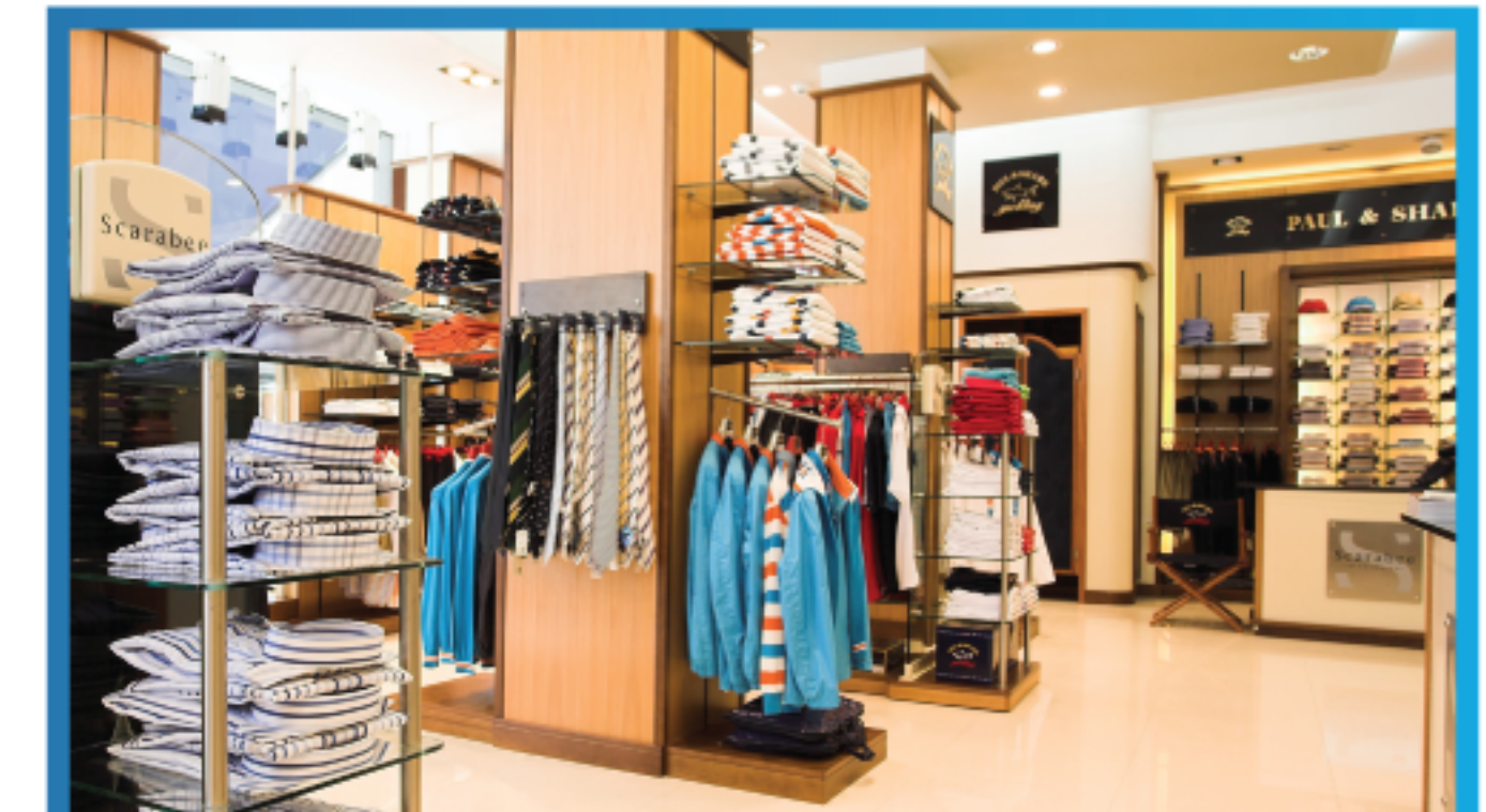
Clothing & Brand Outlet 1,60,000sft