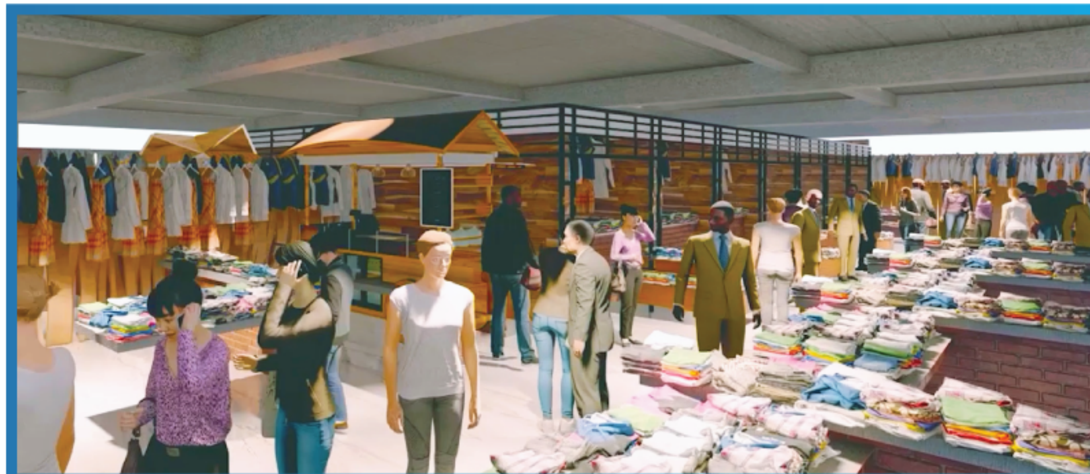
Hawker's Zone 1,20,000sft