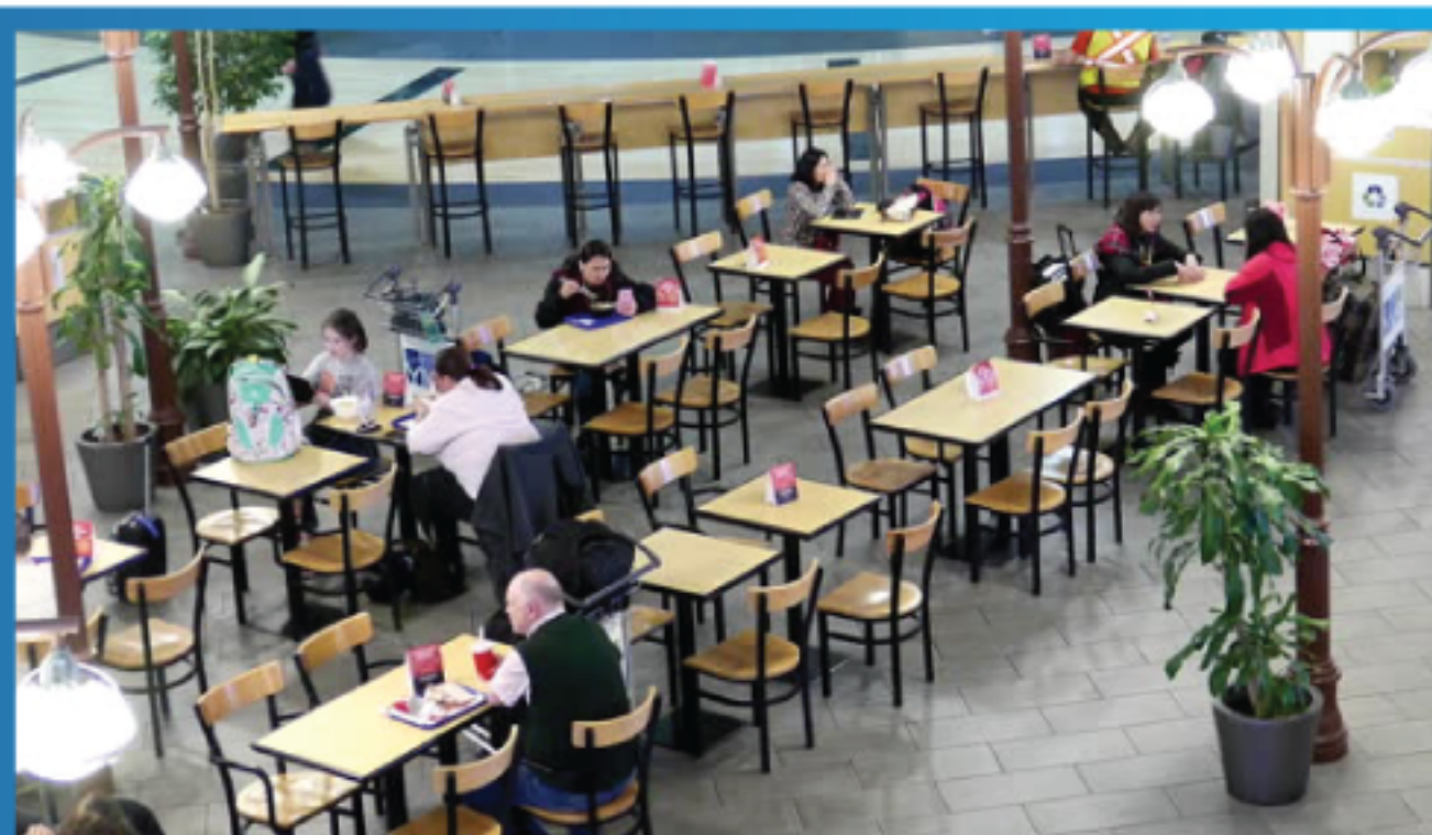
Food Court 40,000sft